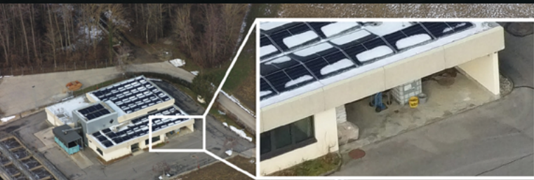
RGB camera with 32x zoom