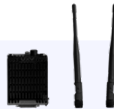
Radio module with short range antenna